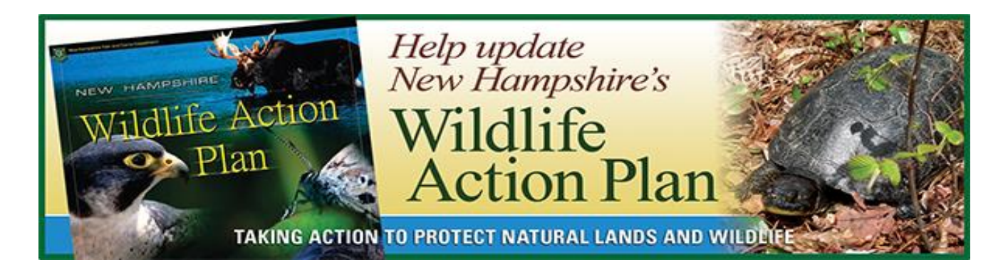
Figure 1-1. A banner displaying the Wildlife Action Plan cover and encouraging participants to become involved with the 2015 revision.