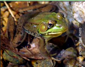
GREEN FROG Rana clamitans melanota

Size: Up to 20 cm (7.9 in). Largest frog in U.S. Distribution: Widespread throughout N.H. Habitat: Shallow bays and coves of large lakes, slow-moving rivers, streams, and ponds. Voice: A series of deep bass notes resembling the phrase "jug-o'-rum." Males begin calling in May and June.