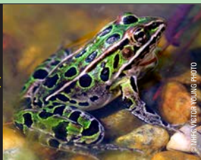
NO. LEOPARD FROG Rana pipiens

Size: 5.5-12.5 cm (2.5-4 in) Distribution: Widespread throughout N.H. Habitat: Moist woodlands and shores of ponds, streams, and lakes. Breeds in shallow waters of ponds, lakes and other permanent waterbodies. Voice: Like the twang of a banjo string, usually given a single note at a time. Often gives a startled yelp as it leaps away.