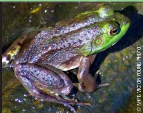
BULLFROG Rana catesbeiana