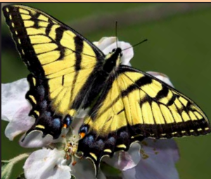
EASTERN TIGER SWALLOWTAIL Papilio glaucus

Description: 3 1 / 8 – 5 1 / 2 ". Yellow w/black stripes across wings. Black borders around edges w/yellow spots. Long black tail on each hind wing.