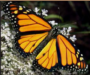
MONARCH Danaus plexippus

Description: 3½ – 4". Above, orange w/black veins and black margins w/white spots. Below, paler orange. Larger size and lack of vein on top hind wings distinguishes from Viceroy.