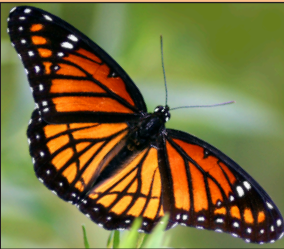
VICEROY Limenitis archippus

Description: 2 5 / 8 – 3". Orange w/black veins above and below. Black border w/white spots. Black vein across hind wings distinguishes from monarch.