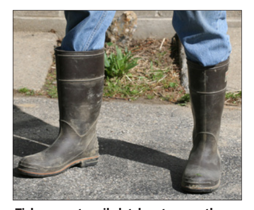
Ticks cannot easily latch onto smooth rubber boots like these.

A repellent recently registered with EPA, 2-undecanone, is derived from wild tomato plants. Some chemical registries refer to the same compound as