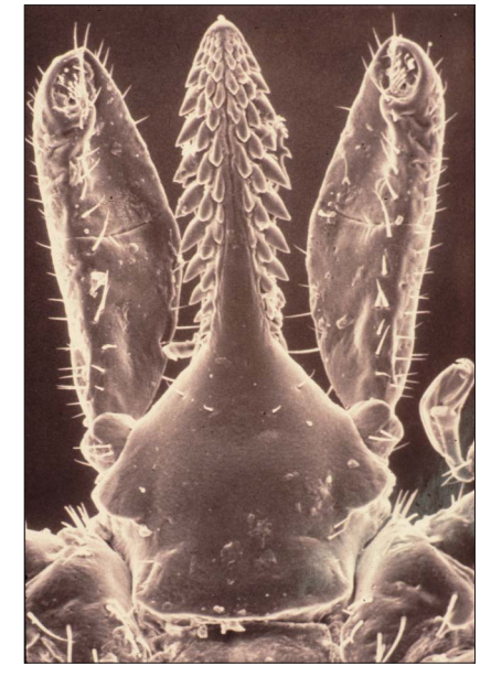
Black legged tick mouth parts. Scanning electron micorscope photo by Nancy Cherim.

A full length mirror or family member can help you see ticks on your back or other difficult to see areas. Don't neglect to check your head, especially if you