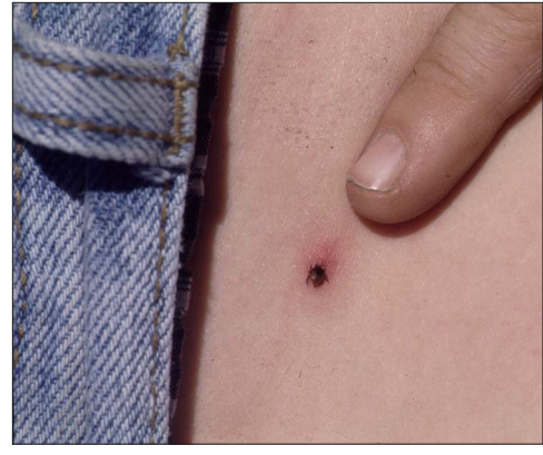
Black legged tick biting a peson. Note the reddish reaction to the biting. This is not the rash.

Anaplasmosis. Human granulocytotropic anaplasmosis is a new name for a relatively new tick-borne disease formerly called HGE (human granulocytic ehrlichiosis). The number of reported cases has been rising for several years, with the highest incidence in people over 60. In 2010, the highest incidence was reported from Minnesota, Wisconsin, New York, New