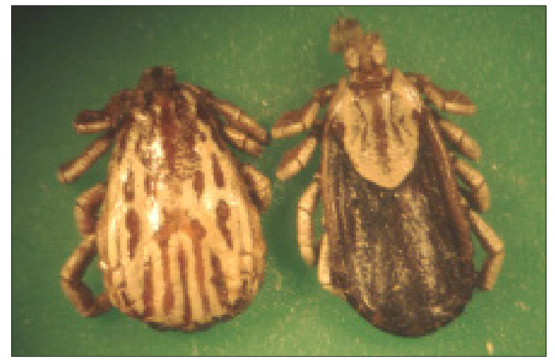
Winter tick male (left) and female (right)

The winter tick, Dermacentor albipictus, is similar in size and appearance to the American dog tick. Unlike that species, the winter tick isn't active in the summer and it completes its entire development on one host. It is often found on moose, deer, or horses during the fall, winter or spring. It doesn't commonly bite people, and does not transmit agents that cause disease in people. Eggs of this species hatch in the spring, but the larvae remain bunched together in a torpor all summer long. They don't become active until cold weather returns in the fall. As with other ticks, they wait on leaf litter or low vegetation for a host to brush by. After attaching to a suitable host, this species remains on the animal, feeding and molting until it has fully grown. Then it drops off, and eggs are laid on the ground in the spring.