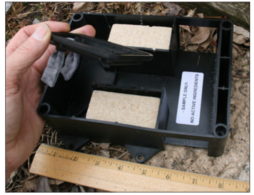
The cover of this tick box has been removed to show the inside.

Your veterinarian can suggest materials to protect pets from ticks. Options include sprays, dips, shampoos, powders, collars, and topical spot treatments. Some can control ticks on dogs and cats for up to a month. Others work for a very short time. Shampoos can kill ticks on the animal, but have very short residual killing effect, if any. Fipronil topical spot treatment is absorbed by the body and gets concentrated in sebaceous glands (at the base of hairs) and their secretions. One treatment can kill ticks for weeks. Some methoprene (primarily acts on fleas), phenothrin, permethrin, and pyriproxifen products are applied as topical spot treatments too, and can last a long time. Tick collars usually