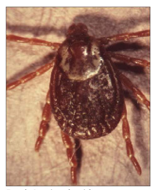
Female American dog tick