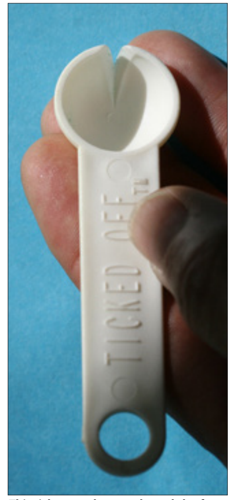
This tick spoon has a v-shaped slot for easy tick removal.

The first case of Powassan Encephalitis in New Hampshire was in 2013.