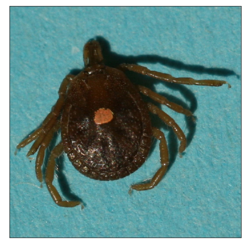
The lone star tick

Ticks can spread several diseases, but except for Lyme disease, anaplasmosis and babesiosis, the incidence of such illnesses is rare in New Hampshire. Other illnesses include Rocky Mountain spotted fever, tularemia, tick paralysis, Powassan encephalitis, Colorado tick fever and ehrlichiosis.