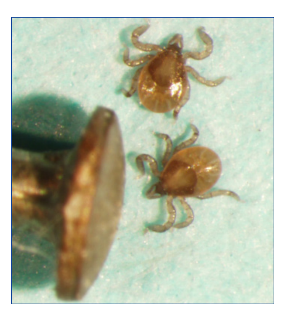
Blacklegged tick larvae & pinhead