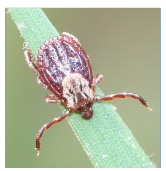
Questing American dog tick