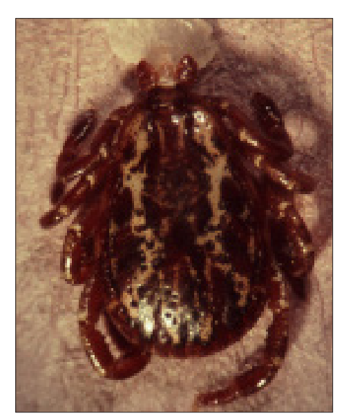
Male American dog tick