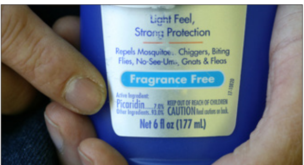
The label lists the active ingredients and their percentages.

Amitraz and permethrin are two pesticides for ticks that show what is sometimes called repellency. Rather than being true repellents, they seem to create irritation and toxicity symptoms in ticks, which cause ticks to drop off and prevents them from attaching. Tick control products containing fipronil can also prevent tick attachment, which some people interpret as "repellency".